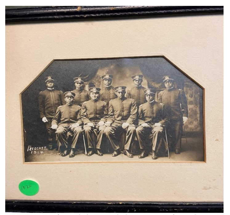
Item # 1020, framed photograph depicting 9 uniformed men